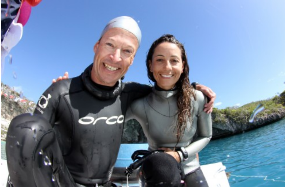
Team Chile celebrates.

There are only two more days of diving to be had at Suunto Vertical Blue, and what a competition it has been thus far! The tally of national records in aggregate is a whopping 47, and of those eight were set today on the opening day of the final act of the competition. Chief among today's eight were Misuzu Hirai's fantastic effort in Constant Weight (CWT) with a big dive to 90m for such a small lady, and the third national record for Chilean freediver Simon Bennett who completed a FIM performance to 60m and attained a personal best -- rocking what Simon calls "old school" style "no packing and a big chunky mask!"