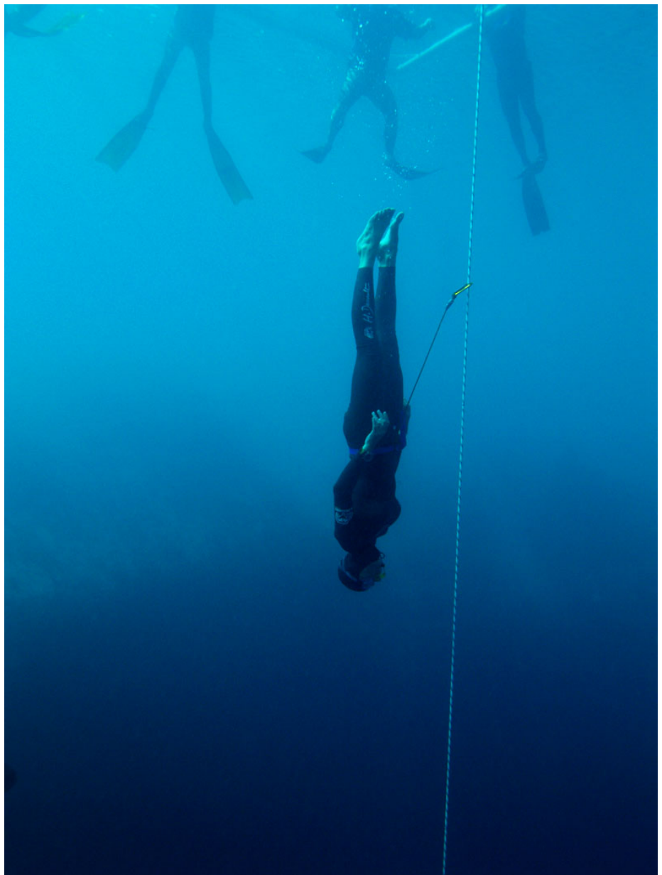
aiming for the darkness...