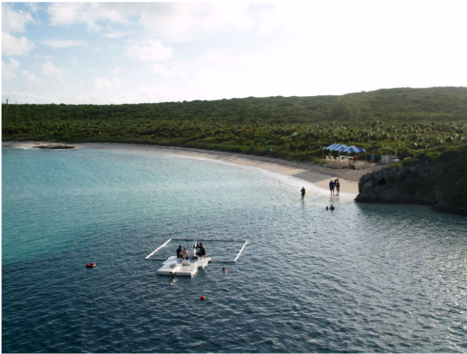
The site for the 2009 AIDA Freediving World Championships: Dean's Blue Hole, Long Island, Bahamas.