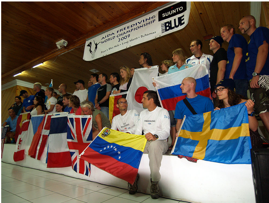
photoshoot at the opening ceremony