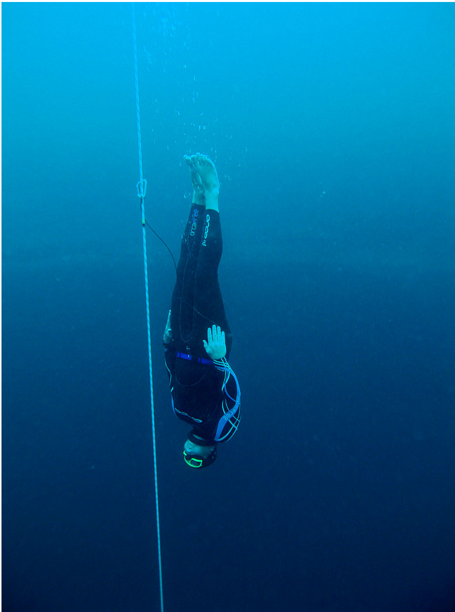
The last stroke before the freefall.